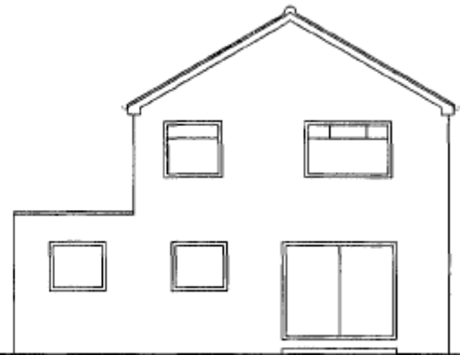
REAR ELEVATION - EXISTING (1:100)

ALL NEW FINISHES, BRICKWORK, WINDOWS, BRICKWORK DETAILS etc. TO MATCH EXISTING U.N.O.